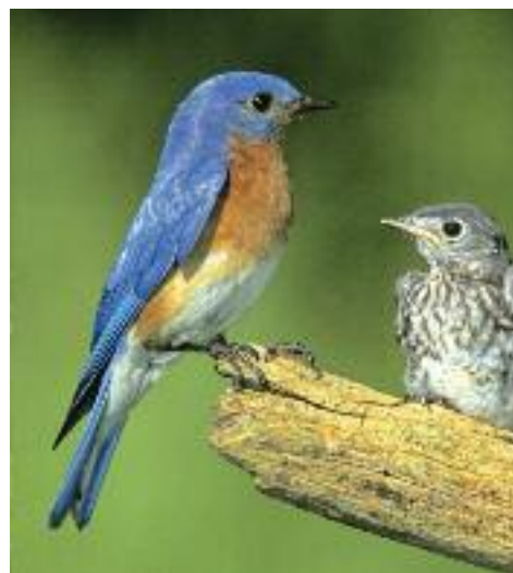
Eastern bluebird Sialia sialis