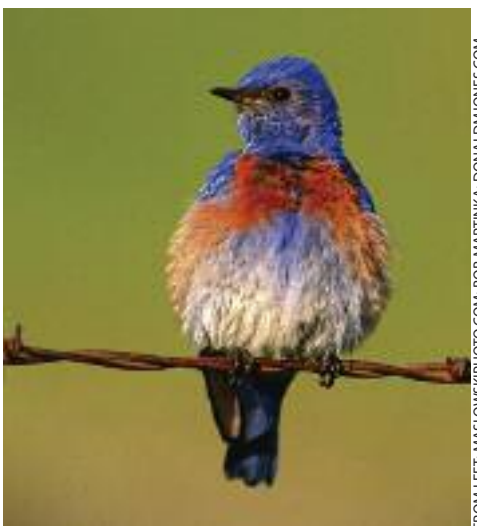
Western bluebird Sialia mexicana