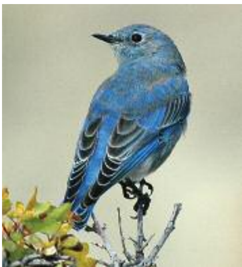
Mountain bluebird Sialia currucoides