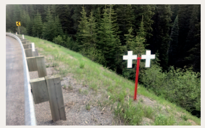
Placed by volunteers with the American Legion, the markers indicate where people have died in traffic accidents.