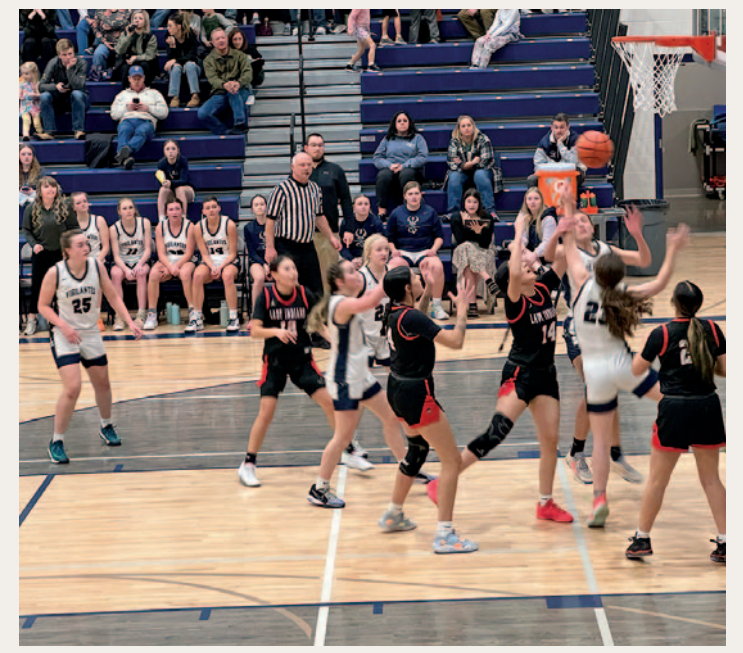
The Browning Lady Indians play the East Helena Vigilantes in a Class A girls basketball game.

Because many shrinking communities no longer have enough high school kids to field sports teams, nearby towns may form sports "co-ops," where two, three, and even four schools join forces to field teams, like the Malta-Whitewater-Saco-Dodson Mustangs in northeastern Montana. When a co-op is formed, the students in all the schools vote on a new team name and mascot.