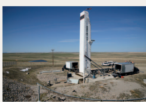
Installing an ICBM silo near Great Falls.

Each ICBM is buried beneath a 110-ton concrete and steel door. The 60-foot-long missiles each weigh about 80,000 pounds and are at least