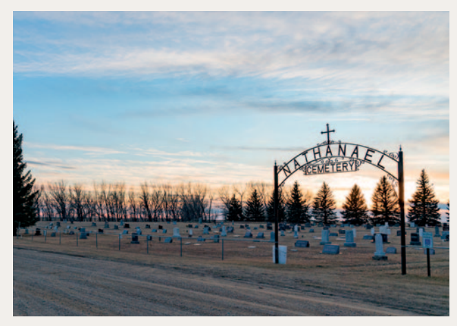
Nathanael Lutheran pioneer cemetery in Dagmar

Friends and family members often place plastic flowers and other memorials at the fatality markers. If the decorations become traffic hazards, Montana Department of Transportation crews have to remove them. The American Legion discourages placing any decorations that obscure the markers because that defeats the crosses' main purpose of highway safety education.