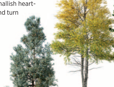
Rocky Mountain juniper Quaking aspen Lodgepole pine Western larch

Trees are far less prevalent in drier eastern Montana. You'll find ponderosa pines and Douglas firs in the island ranges. Along rivers and streams, look for peachleaf willow, cottonwood, American plum, chokecherry, box elder, quaking aspen, and green ash.