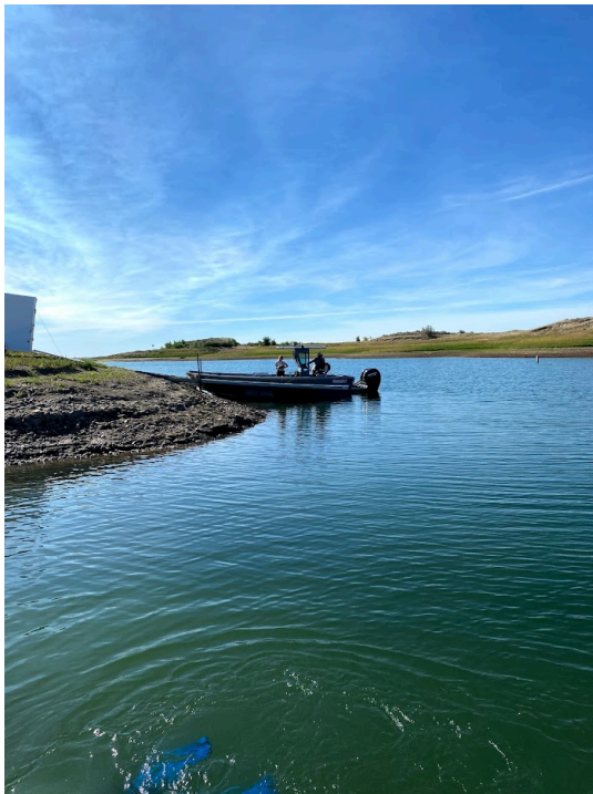
Figure 3. The Dive Team preparing to launch in Duck Creek bay.

The area of Duck Creek bay is approximately 49 acres and an average of 15 feet deep. Wind plays an important role in the Duck Creek bay, with the prevailing winds drive into the shore. An environmental assessment (EA) will be needed to make any chemical applications and can be vetted within 1 weeks' time. There would be no salvaging of species present in the treatment area to prevent any spread of dreissenids. Further if monitoring indicated that there was no evidence or veligers elsewhere, then a targeted chemical treatment would be prioritized. Concurrent dye studies would be conducted with bioassays to ensure treatment application rates and conditions were on target.