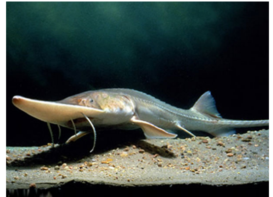
Figure 4. Pallid sturgeon is present in Fort Peck and an ESA listed species.