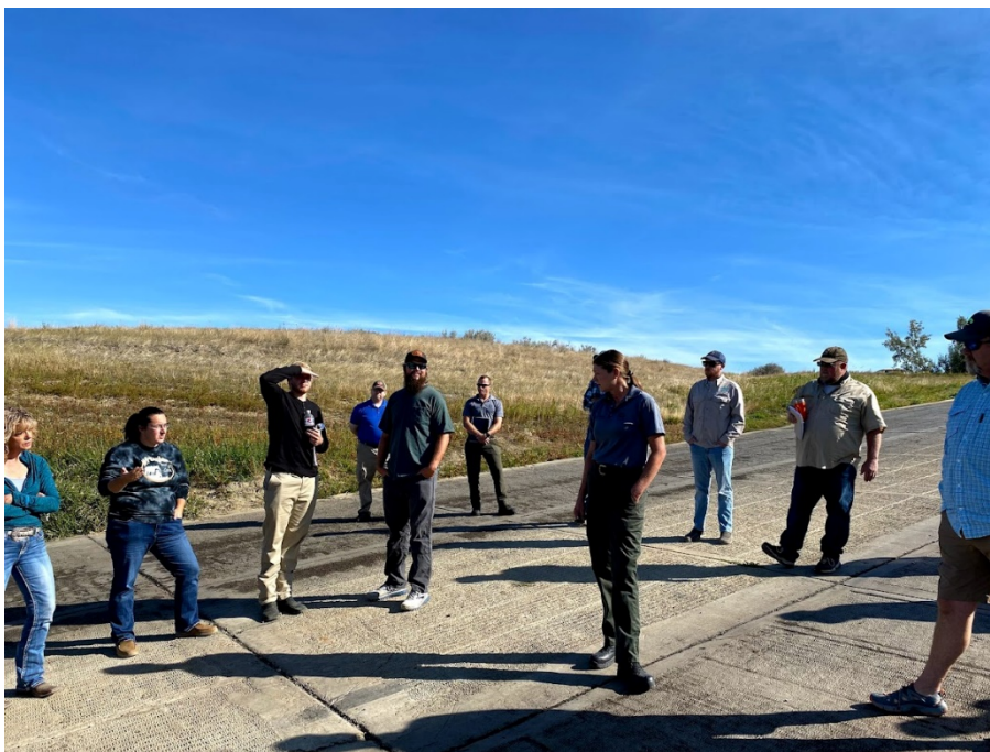
Figure 1. Exercise participants visiting Duck Creek Access Site.

There are many unique species in the area including Endangered Species Act-listed pallid sturgeon ( Scaphirhynchus albus ), and piping plover ( Charadrius melodus ).